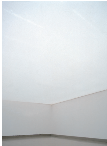
Left - Nick Mauss, Untitled , 2014; Léon Bakst, Une nymphe, costume for L'Après-midi d'un faune , ca. 1912. Exhibition design by Nick Mauss. Designing Dreams: a celebration of Léon Bakst installation view at Nouveau Musée National de Monaco, Monaco, 2016. © Nick Mauss Right - Heimo Zobernig, untitled , 1998, installation view at Bonner Kunstverein, Bonn, 1998. Photo: Archive HZ