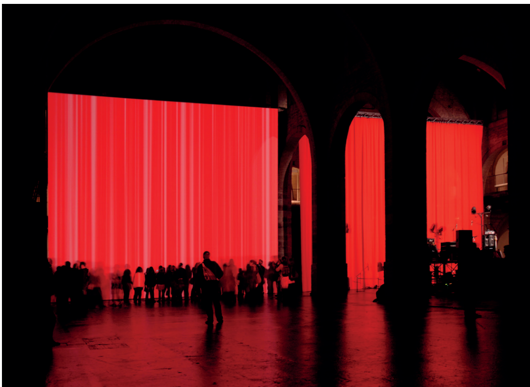
Heimo Zobernig, untitled , 2009, installation view at CAPC, musée d'art contemporain, Bordeaux, 2009.

HZ In my work now, I totally do not refer to the theater. Theater, dance, film, etc., are some of many art forms that reflect on reality as such: The body takes in reality with every sense. Next, there is the brain that finds combinations for everything and creates perception: the “presentation.” We then know what is behind, above, below us. We have a rough vision of our position, in space and time. The things, the spaces, the city lead our way through the world. And this is reflected in very different art forms.