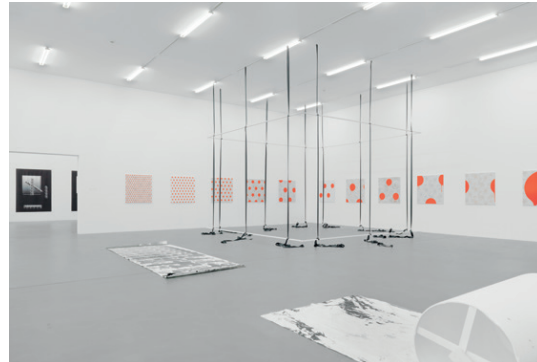
Opposite - Anne Teresa De Keersmaeker, Work/Travail/Arbeid at WIELS, Brussels, 2015.