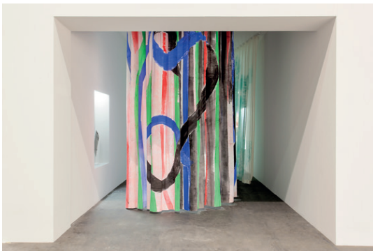
Heimo Zobernig installation view at MUDAM Luxembourg, Musée d'Art Moderne Grand-Duc Jean, Luxembourg, 2014.